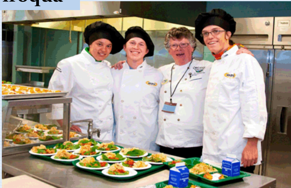
COOKING UP CHANGE 2010 National Healthy Cooking Contest